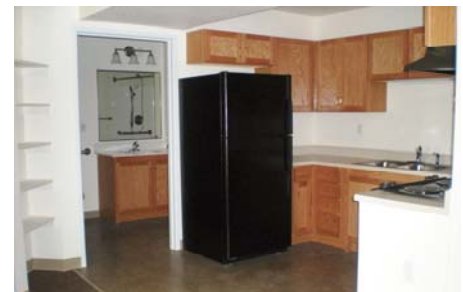
Right: Kitchen and bathroom areas of a consumer apartment