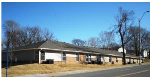
Left: The back side of Summit Apartments complex