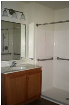
Above: Partial view of bathroom in a consumer apartment

As mentioned in the last CELERATIONS, CDD will be using this newsletter to put out the word that we have brand new apartments nearly ready for occupancy. Our funders and referral sources are very well aware of the new Summit Apartments at 9th and Brooklyn. Like our group home opera-